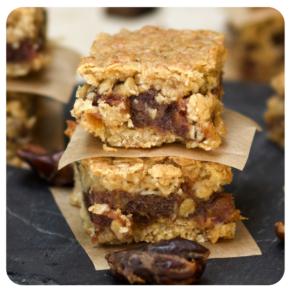
Ordering - Cakes & Traybakes